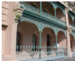
terrace 148 victoria parade east melbourne front elevation oct1999