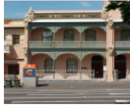
1 terrace 148 victoria parade east melbourne front view oct1999