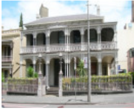
TERRACE SOHE 2008