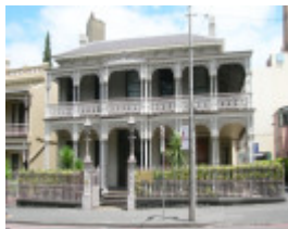
TERRACE SOHE 2008