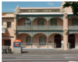
1 terrace 148 victoria parade east melbourne front view oct1999