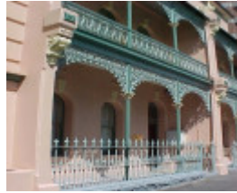
terrace 148 victoria parade east melbourne front elevation oct1999