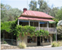
FORMER WARRANDYTE WINE HALL SOHE 2008