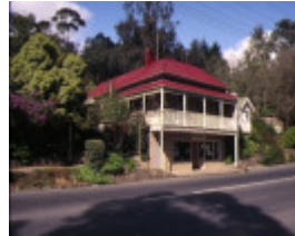
1 former warrandyte wine hall yarra street warrandyte front view