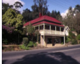
1 former warrandyte wine hall yarra street warrandyte front view