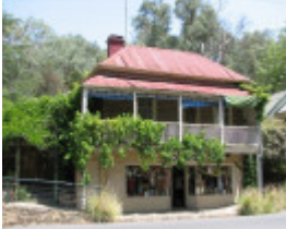
FORMER WARRANDYTE WINE HALL SOHE 2008