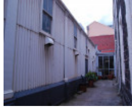
H2172 All Saints Hall King William Street Fitzroy April 2008 10