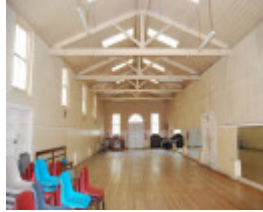
H2172 All Saints Hall King William Street Fitzroy April 2008 5