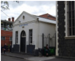
H2172 All Saints Hall King William Street Fitzroy April 2008 15