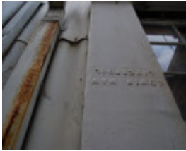
H2172 All Saints Hall King William Street Fitzroy April 2008 13