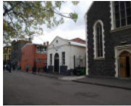
H2172 All Saints Hall King William Street Fitzroy April 2008 14