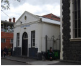
H2172 All Saints Hall King William Street Fitzroy April 2008 compressed