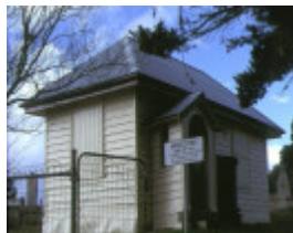
1 maldon road toll house muckleford front view