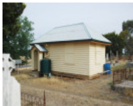
MALDON ROAD TOLL BAR HOUSE SOHE 2008