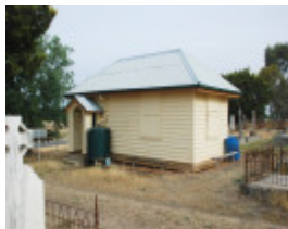
MALDON ROAD TOLL BAR HOUSE SOHE 2008