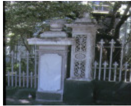
ensor 172 victoria parade east melbourne entrance gates nov1990