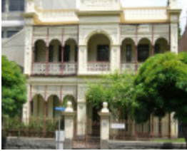
ENSOR SOHE 2008