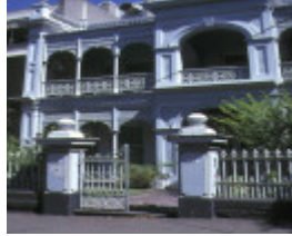
1 ensor 172 victoria parade east melbourne front view nov1990