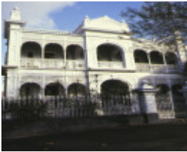
Ensor 172 Victoria Parade Front View