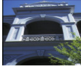
ensor 172 victoria parade east melbourne detail of balcony nov1990