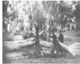
H02000 glenrowan heritage precinct siege2