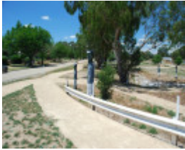
GLENROWAN HERITAGE PRECINCT SOHE 2008