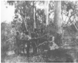
H02000 glenrowan heritage precinct siege1