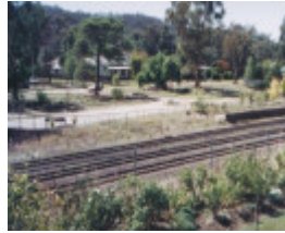
H02000 1 glenrowan heritage precinct siege site general