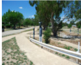
GLENROWAN HERITAGE PRECINCT SOHE 2008