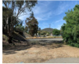
2021 site of former Stationmaster s House