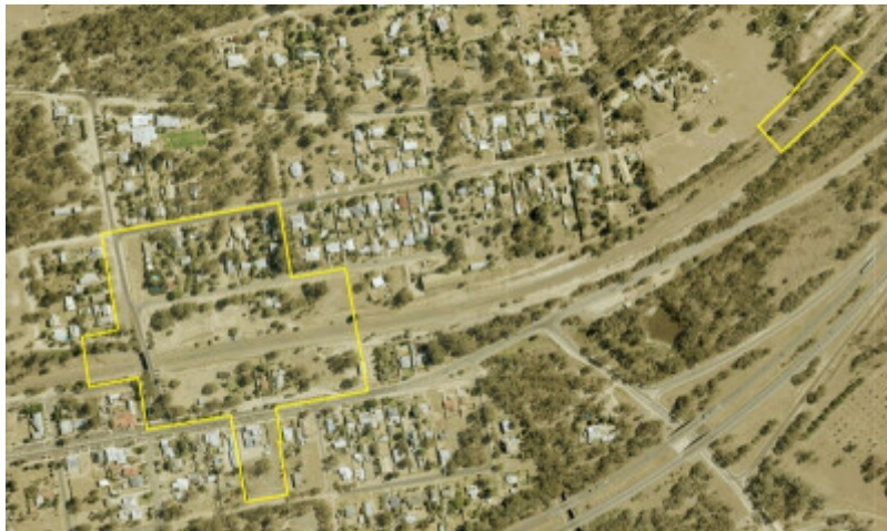
Aerial plan of extent of registration