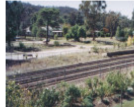
H02000 1 glenrowan heritage precinct siege site general