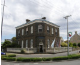
FORMER BANK OF AUSTRALASIA SOHE 2008