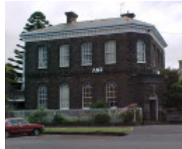
former bank of australasia sackville street port fairy front view nov1999