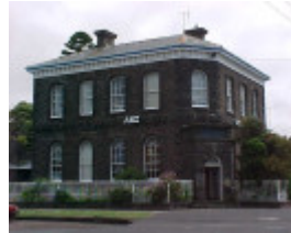
former bank of australasia sackville street port fairy front elevation nov1999