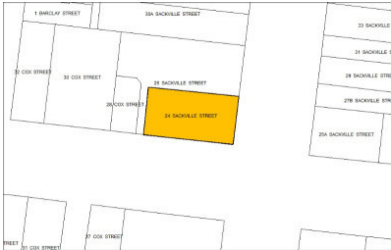
H0749 ho749 former bank of Australasia extent in Mapinfo