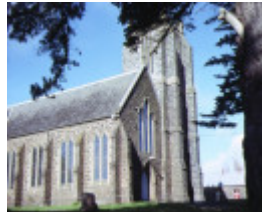
1 st john's anglican church barclay street port fairy side view jul1980