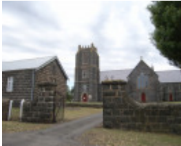
ST JOHNS ANGLICAN CHURCH SOHE 2008