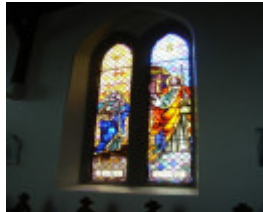
ST JOHNS ANGLICAN CHURCH SOHE 2008