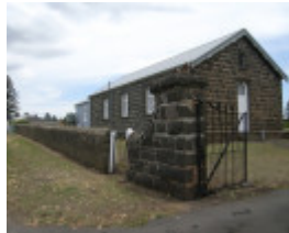
ST JOHNS ANGLICAN CHURCH SOHE 2008