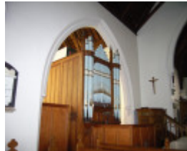
ST JOHNS ANGLICAN CHURCH SOHE 2008