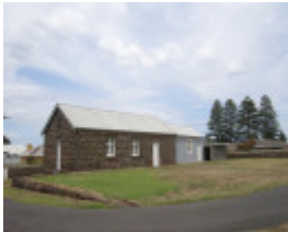
ST JOHNS ANGLICAN CHURCH SOHE 2008