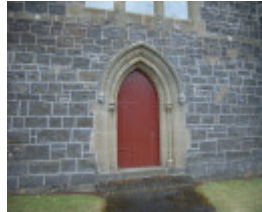
ST JOHNS ANGLICAN CHURCH SOHE 2008