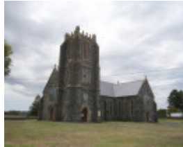
ST JOHNS ANGLICAN CHURCH SOHE 2008