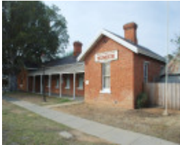
FORMER POLICE STATION SOHE 2008