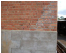
Before Photographs - Reference 3906 2014