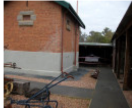
After Photographs - Reference F3906 2016