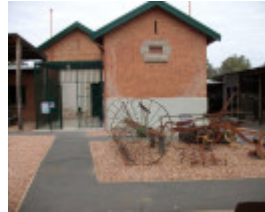
After Photographs - Reference F3906 2016