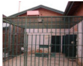
Before Photographs - Reference 3906 2014