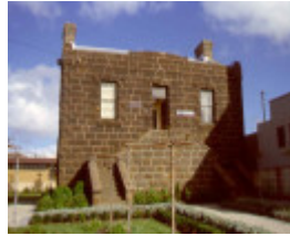
1 portland customs front view ms aug1999