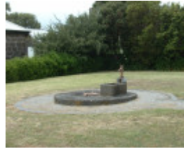
CUSTOMS HOUSE SOHE 2008