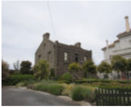
CUSTOMS HOUSE SOHE 2008