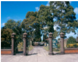
h01081 st kilda cemtery entrance