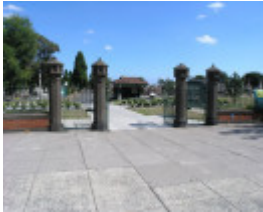
ST KILDA CEMETERY SOHE 2008