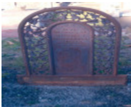
h01081 st kilda cemetery iron memorial