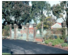
h01081 st kilda cemetery rear gates