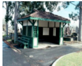
h01081 st kilda cemetery shelter