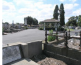
ST KILDA CEMETERY SOHE 2008