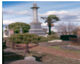
h01081 st kilda cemetery von mueller