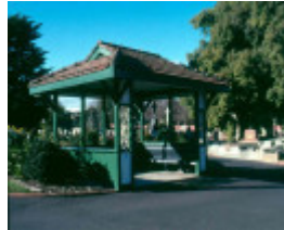
h01081 1 st kilda cemetery shelter3