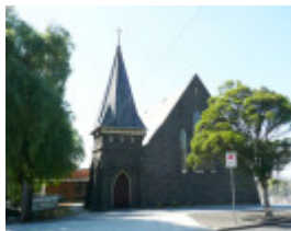
CHURCH OF CHRIST SOHE 2008