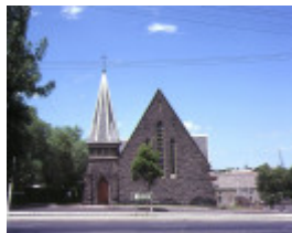
1 church of christ trinity church la trobe terrace geelong front view jan1981