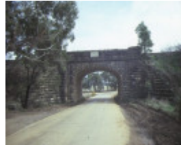
1 rail bridge & embankment geelong ballarat line elaine side view aug 84