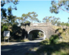
RAIL BRIDGE AND EMBANKMENT SOHE 2008