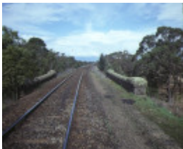
rail bridge & embankment geelong ballarat line elaine rail detail