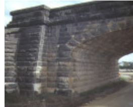
rail bridge & embankment geelong ballarat line elaine arch detail aug 84