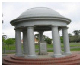
PROV2089 Avenue of Honour Arch Victory 10.05 rotunda