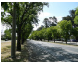
AVENUE OF HONOUR AND ARCH OF VICTORY SOHE 2008