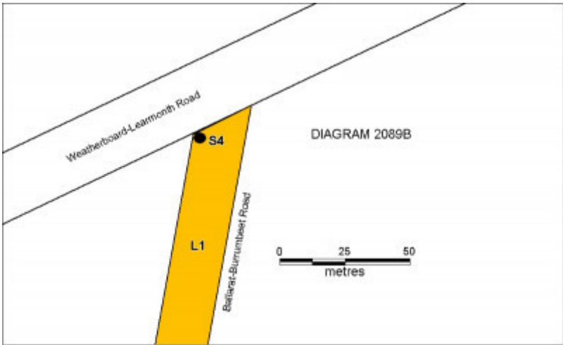
PROV2089 Avenue of Honour Arch of Victory plan 2089B