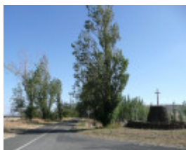
AVENUE OF HONOUR AND ARCH OF VICTORY SOHE 2008