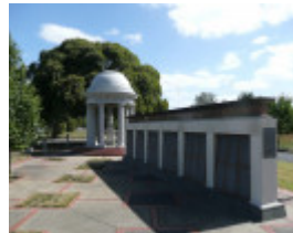
AVENUE OF HONOUR AND ARCH OF VICTORY SOHE 2008