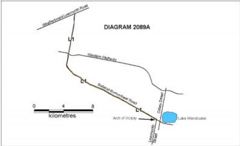
PROV2089 Avenue of Honour Arch of Victory plan 2089A