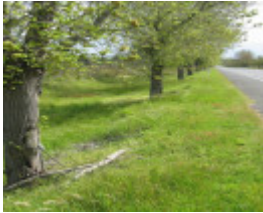
PROV2089 Avenue of Honour Arch Victory 10.05 trees