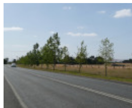
AVENUE OF HONOUR AND ARCH OF VICTORY SOHE 2008