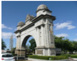
AVENUE OF HONOUR AND ARCH OF VICTORY SOHE 2008