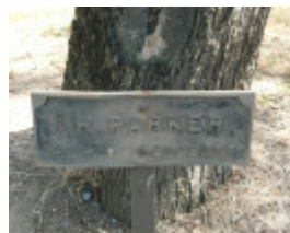
AVENUE OF HONOUR AND ARCH OF VICTORY SOHE 2008