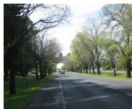
PROV2089 Avenue of Honour Arch Victory 10.05