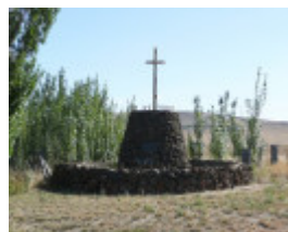
AVENUE OF HONOUR AND ARCH OF VICTORY SOHE 2008