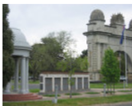
PROV2089 Avenue of Honour Arch Victory 10.05 Precint