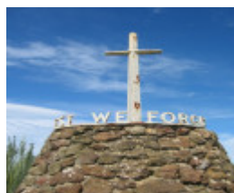
PROV2089 Avenue of Honour Arch Victory 10.05 cairn