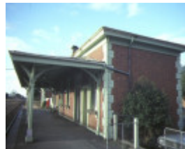
elmore railway station & water tower side view jul1984