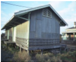
elmore railway station & water tower goods shed jul1984