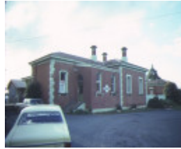
elmore railway station & water tower front view jul1984