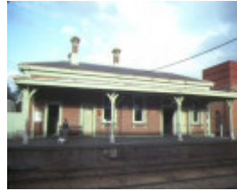
1 elmore railway station & water tower trackside view jul1984