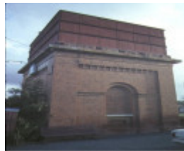
elmore railway station & water tower front view