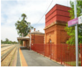
ELMORE RAILWAY STATION AND WATER TOWER SOHE 2008