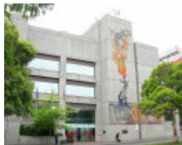
EASTERN HILL FIRE STATION SOHE 2008