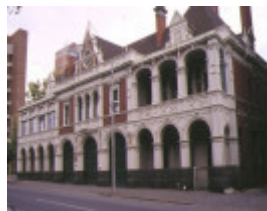
1 eastern hill fire station victoria parade east melbourne front view feb1994