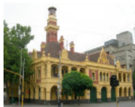
EASTERN HILL FIRE STATION SOHE 2008