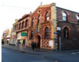
H2175 Chinese Mission Church Little Bourke Street May 2008 compressed