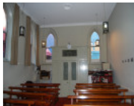
4246 Chinese Mission Church. Ground floor interior.