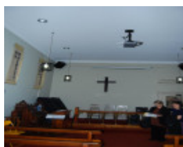
H2175 Chinese Mission Church. Ground floor.