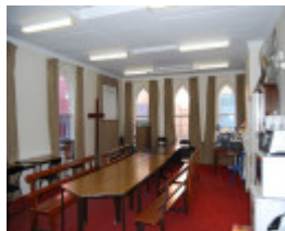
4246 Chinese Mission Church 9. First floor interior.