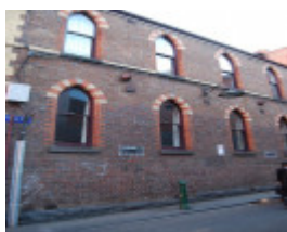
4246 Chinese Mission Church 14. Heffernan Lane facade