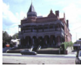
1 queenscliff hotel gellibrand street queenscliff front view mar1985