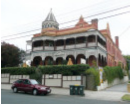
QUEENSCLIFF HOTEL SOHE 2008