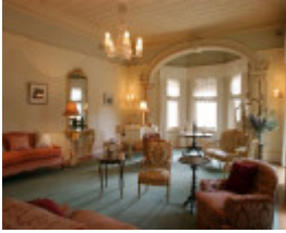
H0614 Rippon Lea sitting - National Trust of Australia (Victoria)