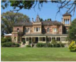
RIPPON LEA SOHE 2008