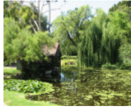
RIPPON LEA SOHE 2008