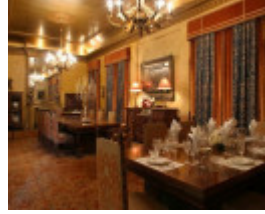
H0614 Rippon Lea Dining - National Trust of Australia (Victoria)