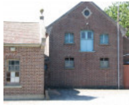
RIPPON LEA SOHE 2008