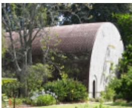
RIPPON LEA SOHE 2008