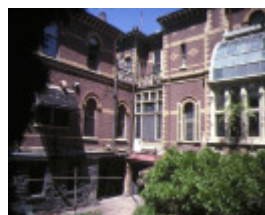
ripponlea elsternwick service wing & yard nov1984