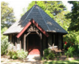
RIPPON LEA SOHE 2008