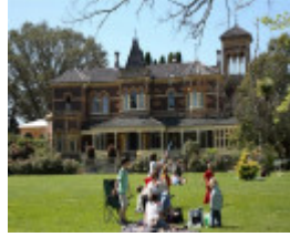
H0614 Rippon Lea family picnic - National Trust of Australia (Victoria)