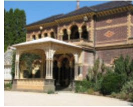
RIPPON LEA SOHE 2008