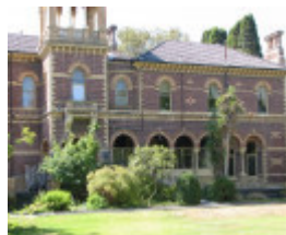
RIPPON LEA SOHE 2008