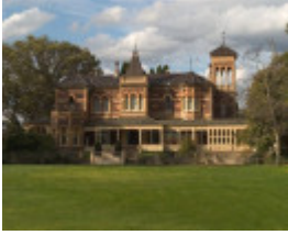
H0614 Rippon Lea - National Trust of Australia (Vic)