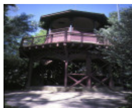
ripponlea elsternwick look out tower nov1984