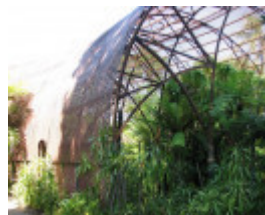
RIPPON LEA SOHE 2008