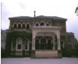
1 ripponlea elsternwick front entrance