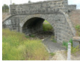
Bluestone Bridge over Bruce's Creek Lethbridge