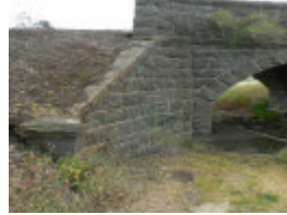
Bluestone Bridge over Bruce's Creek Lethbridge