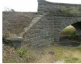
Bluestone Bridge over Bruce's Creek Lethbridge