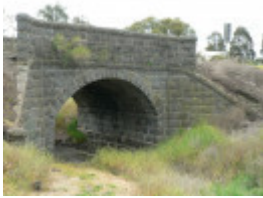
Bluestone Bridge over Bruce's Creek Lethbridge