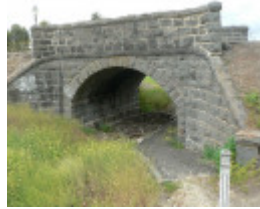
Bluestone Bridge over Bruce's Creek Lethbridge