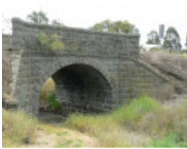
Bluestone Bridge over Bruce's Creek Lethbridge