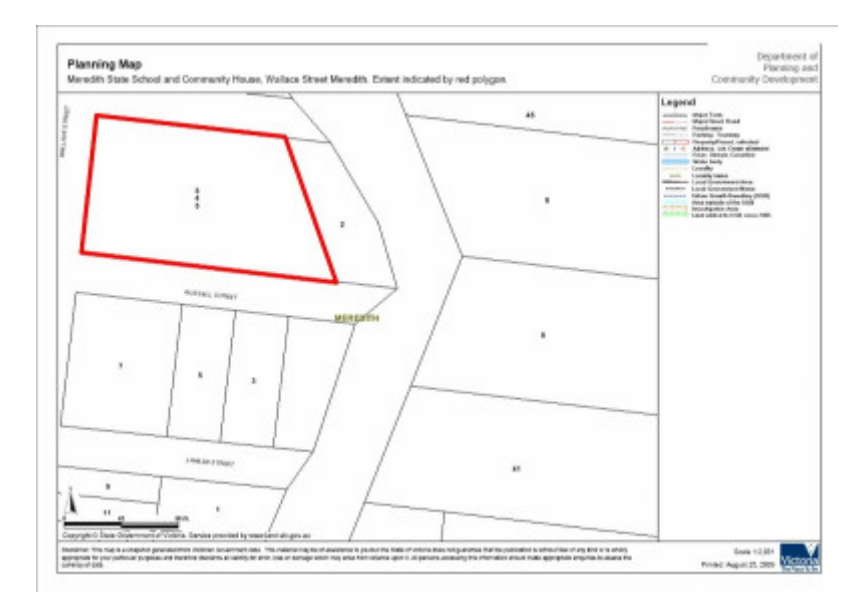
Extent of registration map