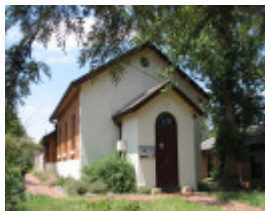
ELTHAM COURT HOUSE SOHE 2008