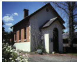
eltham court house main road eltham front corner elevation