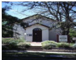
1 eltham court house main road eltham front entrance