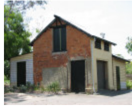
FORMER POLICE QUARTERS SOHE 2008