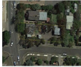
Aerial view of extent of registration