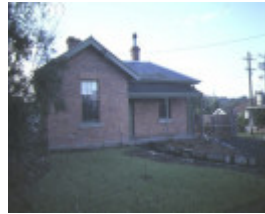
1 former police quarters main road eltham front view apr1986