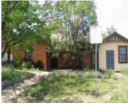
FORMER POLICE QUARTERS SOHE 2008