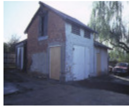
former police quarters main road eltham stables apr1986