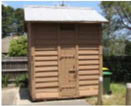
FORMER POLICE QUARTERS SOHE 2008