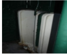
Urinal Queensberry & Elizabeth porcelain stall KJ 21 06 2007