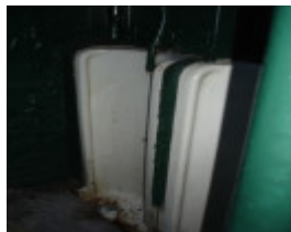
Urinal Queensberry & Elizabeth porcelain stall KJ 21 06 2007