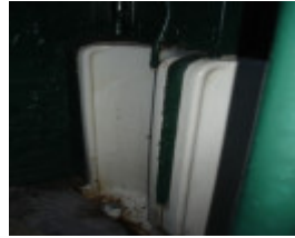
Urinal Queensberry & Elizabeth porcelain stall KJ 21 06 2007