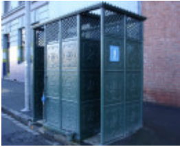
Urinal Queensberry & Elizabeth St exterior KJ 21 06 2007