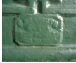
Urinal Queensberry & Swanston nameplate KJ 21 06 2007