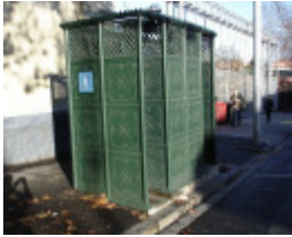
Urinal Queensberry & Swanston exterior view KJ 21 06 2007