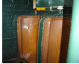
Urinal Queensberry & Swanston terracotta stall 21 06 2007