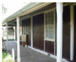
4334_Seymour_Cottage_Rom: 4334_Seymour_Cottage_Rom: 4334_Seymour_Cottage_Rom: