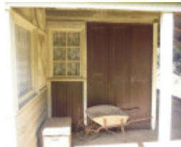
4334_Seymour_Cottage_Rom: 4334_Seymour_Cottage_Rom: 4334_Seymour_Cottage_Rom: