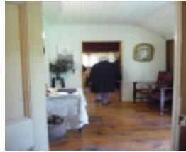
4334_Seymour_Cottage_Rom: 4334_Seymour_Cottage_Rom: 4334_Seymour_Cottage_Rom: