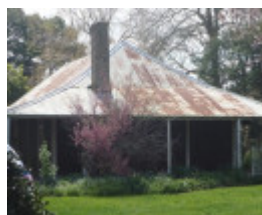
4334_Seymour_Cottage_Rom: 4334_Seymour_Cottage_Rom: 4334_Seymour_Cottage_Rom: