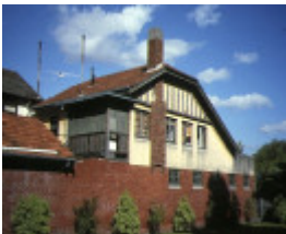
hartpury court complex milton street elwood rear view