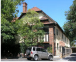
HARTPURY COURT COMPLEX SOHE 2008