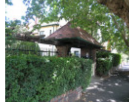
HARTPURY COURT COMPLEX SOHE 2008