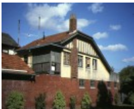
hartpury court complex milton street elwood rear view