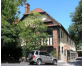
HARTPURY COURT COMPLEX SOHE 2008