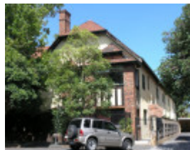
HARTPURY COURT COMPLEX SOHE 2008