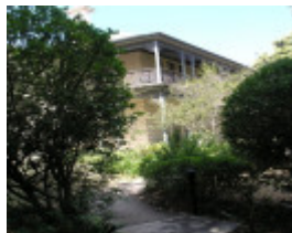
HARTPURY COURT COMPLEX SOHE 2008