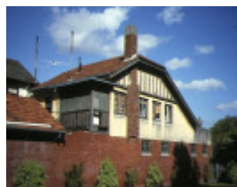
hartpury court complex milton street elwood rear view