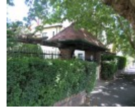
HARTPURY COURT COMPLEX SOHE 2008