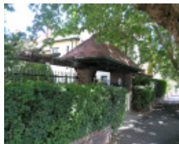
HARTPURY COURT COMPLEX SOHE 2008