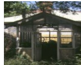
hartpury court complex milton street elwood greenhouse nov1988