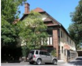
HARTPURY COURT COMPLEX SOHE 2008