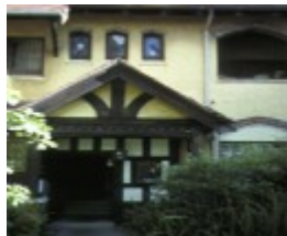
hartpury court complex milton street elwood entrance