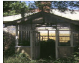
hartpury court complex milton street elwood greenhouse nov1998