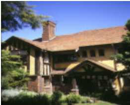
1 hartpury court complex milton street elwood front view nov1998