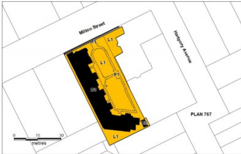
H0767 hartpury court h767 revised extent of registration august2000