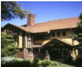
1 hartpury court complex milton street elwood front view nov1998