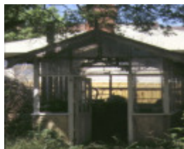
hartpury court complex milton street elwood greenhouse nov1988