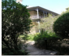
HARTPURY COURT COMPLEX SOHE 2008