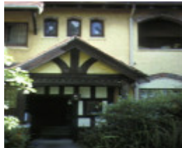
hartpury court complex milton street elwood entrance