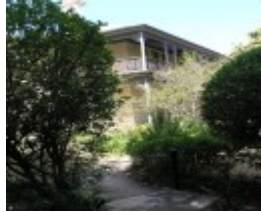
HARTPURY COURT COMPLEX SOHE 2008