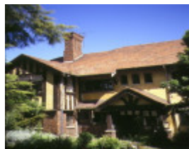
1 hartpury court complex milton street elwood front view nov1998