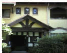
hartpury court complex milton street elwood entrance