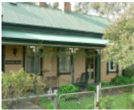
Former Police Station and Residence, 42 Ferrars Street Rokewood