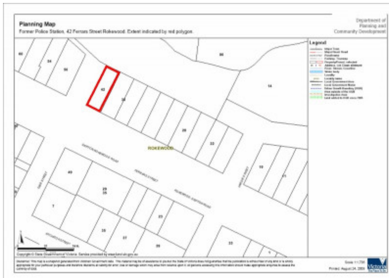
Extent of registration map