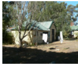
Former Police Station and Residence, 42 Ferrars Street Rokewood