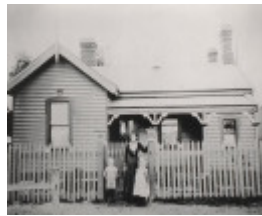
Rokewood Police Station