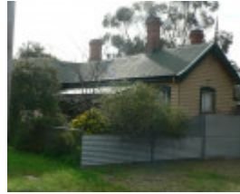
Former Police Station and Residence, 42 Ferrars Street Rokewood