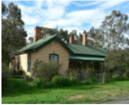
Former Police Station and Residence, 42 Ferrars Street Rokewood