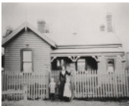
P043 GHC Rokewood Police Station.jpg