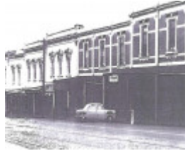
Rokewood Police Station