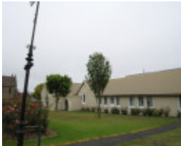
CHRIST CHURCH COMPLEX SOHE 2008