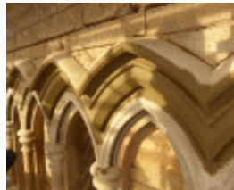
During Photograph - Reference F3866 2015