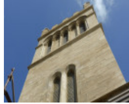
After Photograph - Reference F3866 2016