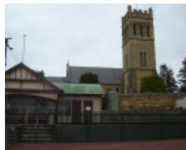
H0387 Christ church warrnambool feb07 ac tennis pavilion 4