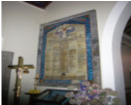
CHRIST CHURCH COMPLEX SOHE 2008