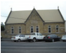
H0387 Christ church warrnambool feb07 ac hall