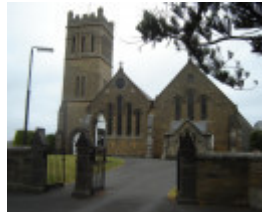
H0387 Christ church warrnambool feb07 ac church12