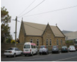
CHRIST CHURCH COMPLEX SOHE 2008