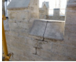
Before Photograph - Reference F3866 2014