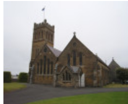
CHRIST CHURCH COMPLEX SOHE 2008