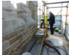
During Photograph - Reference F3866 2015