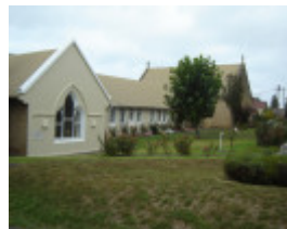
H0387 Christ church warrnambool feb07 ac hall sunday school exterior