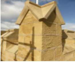
After Photograph - Reference F3866 2016