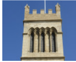
After Photograph - Reference F3866 2016