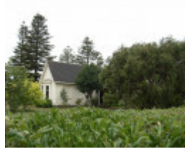
CHRIST CHURCH COMPLEX SOHE 2008