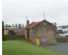
CHRIST CHURCH COMPLEX SOHE 2008