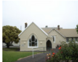
CHRIST CHURCH COMPLEX SOHE 2008