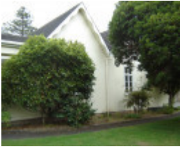
H0387 Christ church warrnambool feb07 ac rectory4