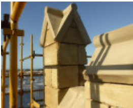
During Photograph - Reference F3866 2015