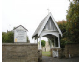
CHRIST CHURCH COMPLEX SOHE 2008