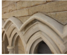
After Photograph - Reference F3866 2016