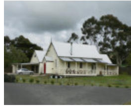
Former Presbyterian Church, 143 Russells Bridge Road, Russells Bridge