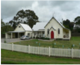
Former Presbyterian Church, 143 Russells Bridge Road, Russells Bridge