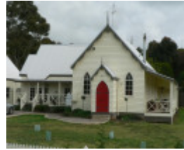
Former Presbyterian Church, 143 Russells Bridge Road, Russells Bridge