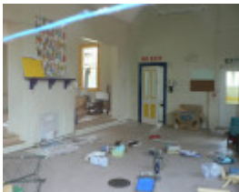
Former Russells Bridge State School, 139 Clyde Hill Road Russells Bridge