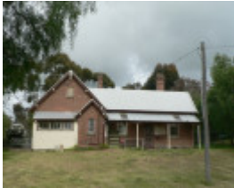
Former Russells Bridge State School, 139 Clyde Hill Road Russells Bridge