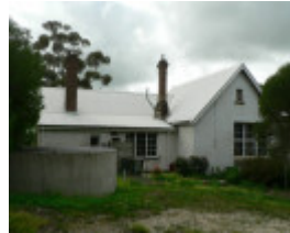
Former Russells Bridge State School, 139 Clyde Hill Road Russells Bridge