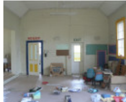
Former Russells Bridge State School, 139 Clyde Hill Road Russells Bridge