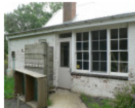
Former Russells Bridge State School, 139 Clyde Hill Road Russells Bridge