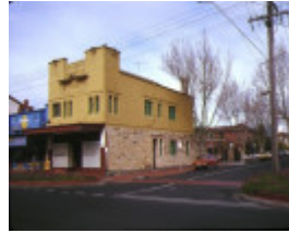
1 former chemist shop ormond road elwood front view