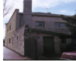
former chemist shop ormond road elwood rear view