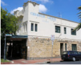
FORMER CHEMIST SHOP SOHE 2008