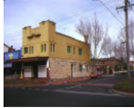
1 former chemist shop ormond road elwood front view