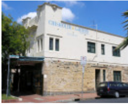
FORMER CHEMIST SHOP SOHE 2008