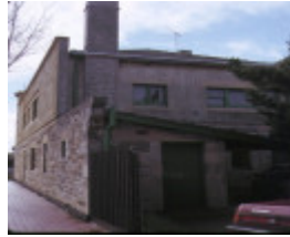
former chemist shop ormond road elwood rear view