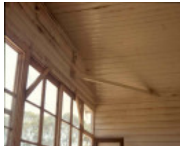
h02051 natimuk primary pavilion interior