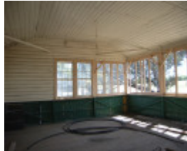
PAVILION CLASSROOM SOHE 2008