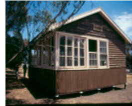
h02051 1 natimuk primary pavilion