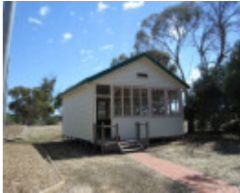
PAVILION CLASSROOM SOHE 2008