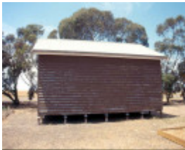
h02051 natimuk primary pavilion