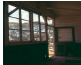
h02051 natimuk primary pavilion interior2