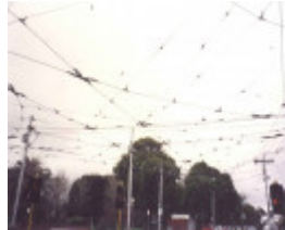
Tramway Crossing Balaclava and Hawthorn Roads