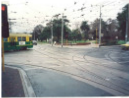
Tramway Crossing, Balaclava and Hawthorn Roads