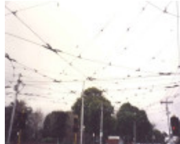
Tramway Crossing Balaclava and Hawthorn Roads