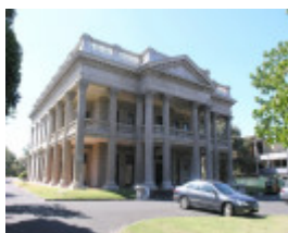
LOWTHER HALL ANGLICAN GIRLS GRAMMAR SCHOOL SOHE 2008