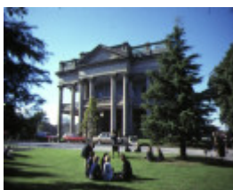
1 earlsbrae hall essendon front view