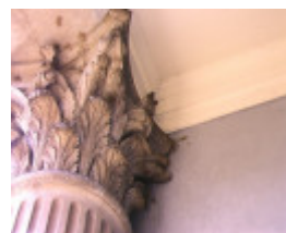
earlsbrae hall essendon detail column capital