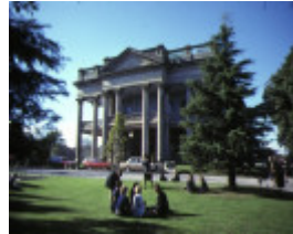
1 earlsbrae hall essendon front view