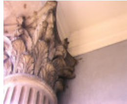
earlsbrae hall essendon detail column capital