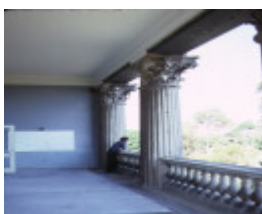
earlsbrae hall essendon view of balcony