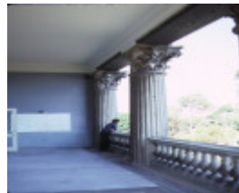
earlsbrae hall essendon view of balcony