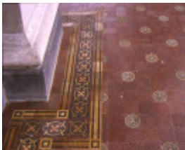
earlsbrae hall essendon detail of tiled entrance