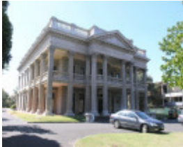
LOWTHER HALL ANGLICAN GIRLS GRAMMAR SCHOOL SOHE 2008