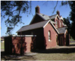
euroa courthouse rear view