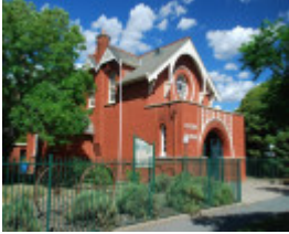
EUROA COURT HOUSE SOHE 2008