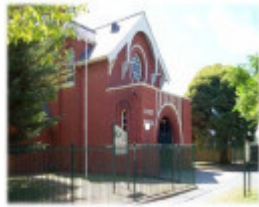
h00960 1 euroa court house binney street euroa street view she project 2004