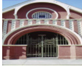
euroa courthouse detail of entrance