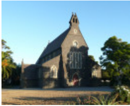
CHURCH OF ST PETER AND ST PAUL SOHE 2008