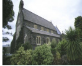
1 church of st peter & st paul mercer street geelong side view apr1997