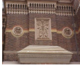
flemington post office wellington street flemington decoration she project 2004