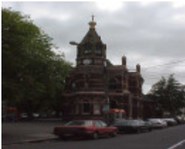
Flemington Post Office Wellington Street Flemington Front View From Street SHE Project 2004