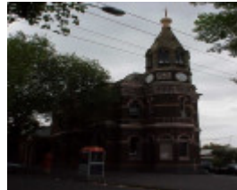
Flemington Post Office Wellington Street Flemington Front View From Street SHE Project