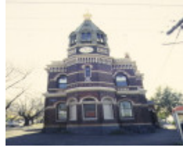
1 flemington post office wellington street flemington front elevation jun1996