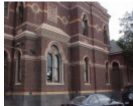
flemington post office wellington street flemington side view she project 2004