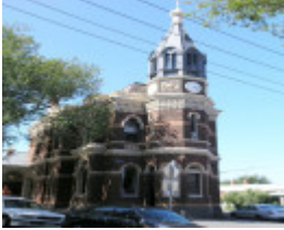
FLEMINGTON POST OFFICE SOHE 2008