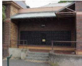
flemington post office wellington street flemington post boxes she project 2004