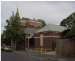
flemington post office wellington street flemington rear she project 2004