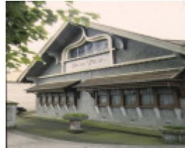
1 park view racecourse road flemington front elevation apr1996