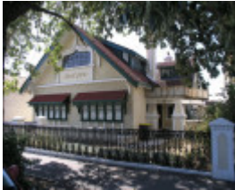
PARK VIEW SOHE 2008