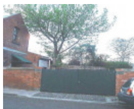
h01204 h1204 166 bellair st kensington stable gates from south