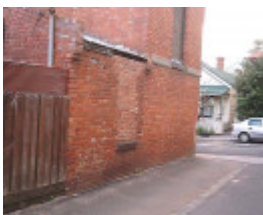
h01204 h1204 166 bellair st kensington rear stables