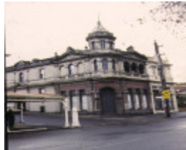
1 former kensington property exchange office shop & residences bellair street kensington front view apr1996