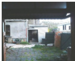
h01204 h1204 166 bellair st kensington rear looking east