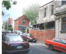
h01204 h1204 166 bellair st kensington general view of rear from south.jpg