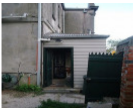
h01204 h1204 166 bellair st kensington rear