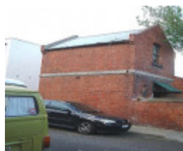
h01204 h1204 166 bellair st kensington stables from south