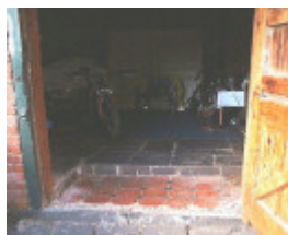
h01204 h1204 166 bellair st kensington rear stables floor recent slate