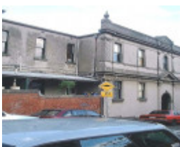
h01204 h1204 166 bellair st kensington southern elevation