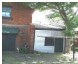
h01204 h1204 166 bellair st kensington rear part stables