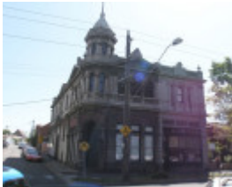
FORMER KENSINGTON PROPERTY EXCHANGE, OFFICE, SHOP AND RESIDENCES SOHE 2008