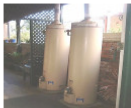
h01204 h1204 166 bellair st kensington rheems boilers nov 2003