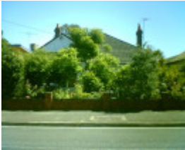
118 Aberdeen Street, Geelong West