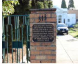
4435 Royal Freemasons Homes 313 Punt Road Gate Plaque 02