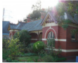
4435 Royal Freemasons Homes 313 Punt Road Building 02