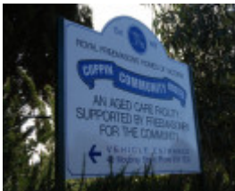
4435 Royal Freemasons Homes 313 Punt Road Sign 02