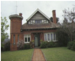
1 anselm glenferrie road caulfield front view sep1998