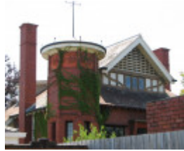
ANSELM SOHE 2008