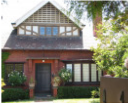
ANSELM SOHE 2008