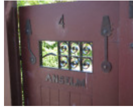
ANSELM SOHE 2008