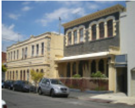
FORMER NATIONAL SCHOOL SOHE 2008