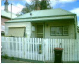
7 Bigmore Street, Geelong West