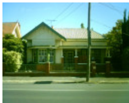
38 Aberdeen Street, Geelong West