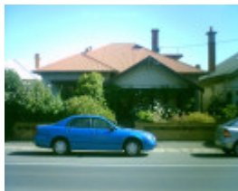
50 Aberdeen Street, Geelong West