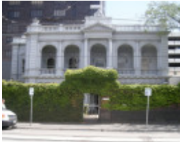
DODGSHUN HOUSE SOHE 2008