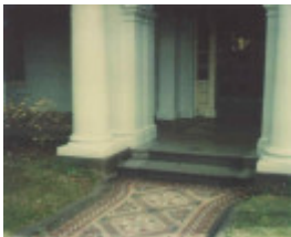
dodgshun house brunswick street fitzroy entrance