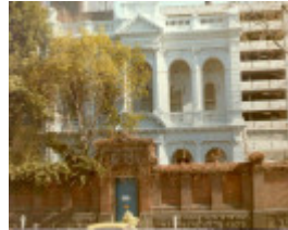
1 dodgshun house brunswick street fitzroy front view