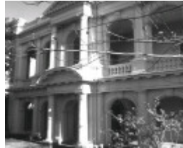
dodgshun house brunswick street fitzroy b&w front elevation