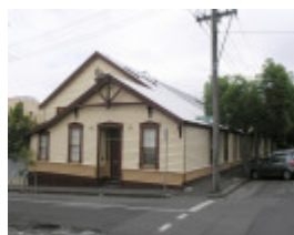
RICHMOND RIFLES VOLUNTEER ORDERLY ROOM SOHE 2008