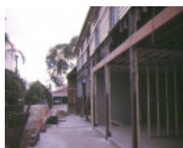
1 former richmond drill hall gipps street richmond rear view