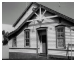
1 former richmond drill hall gipps street richmond front view