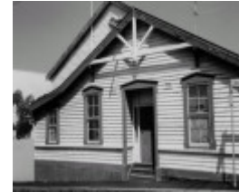
1 former richmond drill hall gipps street richmond front view