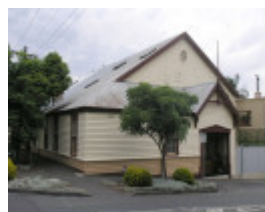
RICHMOND RIFLES VOLUNTEER ORDERLY ROOM SOHE 2008