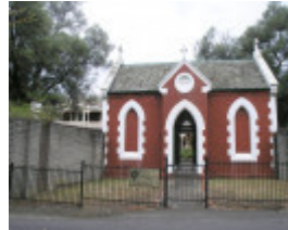
VAUCLUSE COLLEGE SOHE 2008