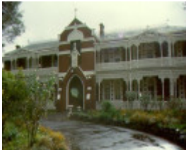
1 vaucluse college richmond convent 1999