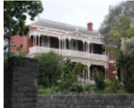
VAUCLUSE COLLEGE SOHE 2008