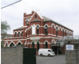
VAUCLUSE COLLEGE SOHE 2008